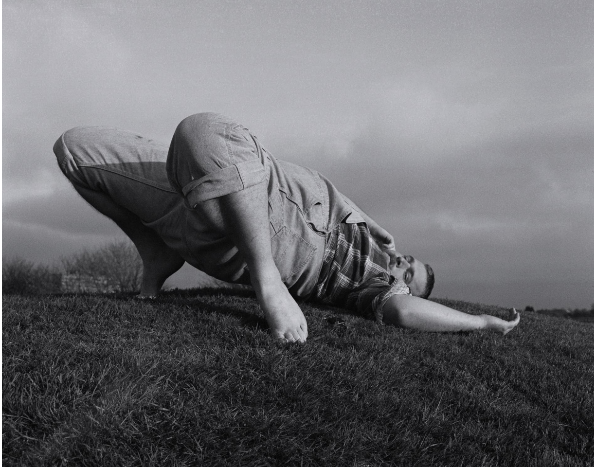
Max Daily Weeding , Kuba Ryniewicz published by Note Note Éditions