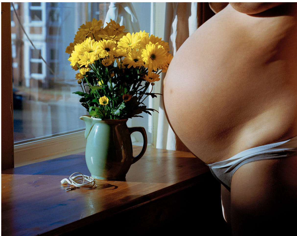
Roxy with Kasper Daily Weeding , Kuba Ryniewicz published by Note Note Éditions