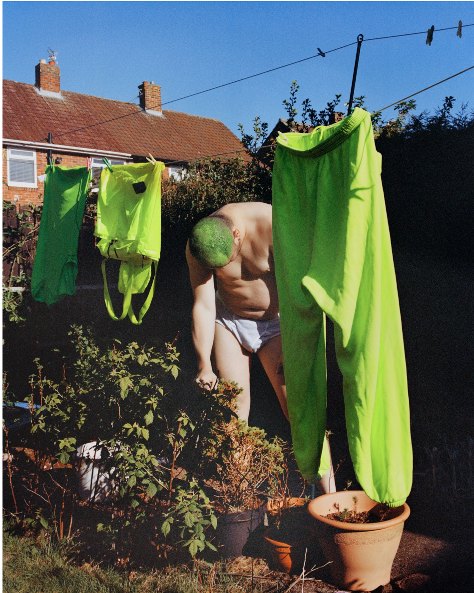
Autoportrait as Green Washings Daily Weeding , Kuba Ryniewicz published by Note Note Éditions